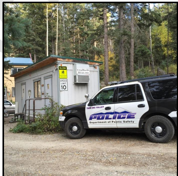
DPS Trailer & Vehicle

Similar to the Fire Department and EMS, many volunteers also volunteer for Search and Rescue (SAR). The SAR service is recognized as a SAR Team by the state of New Mexico Search and Rescue Coordinator.