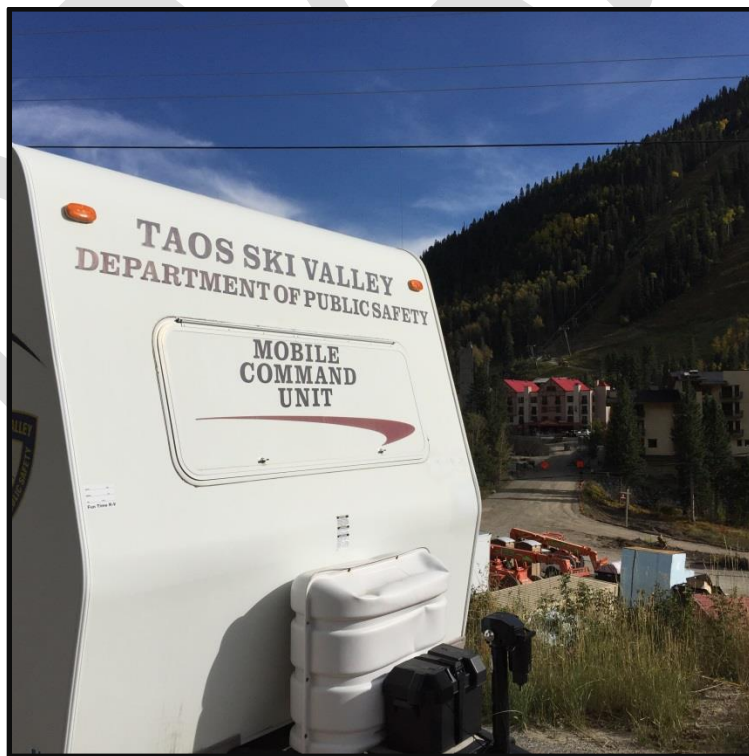
The Mobile Command Unit

The law enforcement office is located in a trailer next door to the Village office on Firehouse Road. The trailer is not adequate for proper law enforcement services. Twining & Associates owns the property and allows the trailer at no cost to the Village.